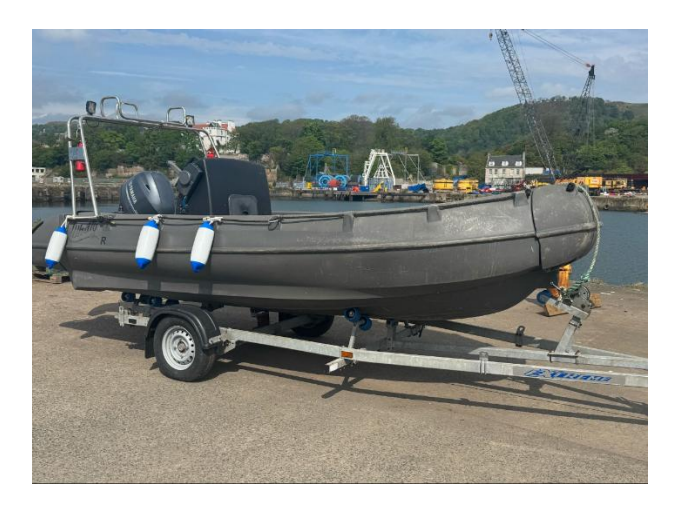
Figure 2 - Shore Worker 1 support boat

Primary equipment Shore worker 1 support boat