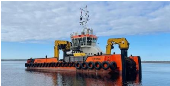
Leask Marine's Barge