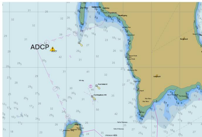
Chart datum = 33m

59° 9.889 N / 59° 9' 20.3832 N 2° 50.491 W / 2 ° 50' 29.4648 W