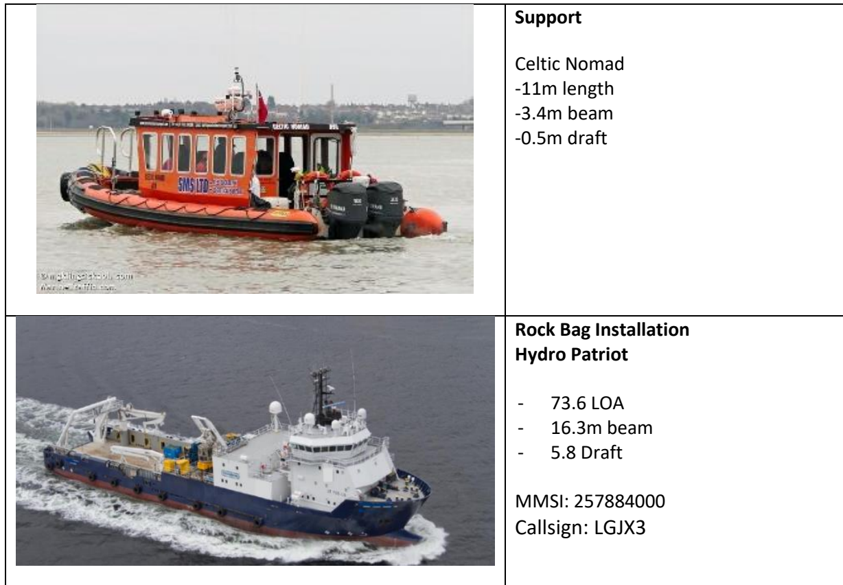
Figure 2 - Vessel Specification