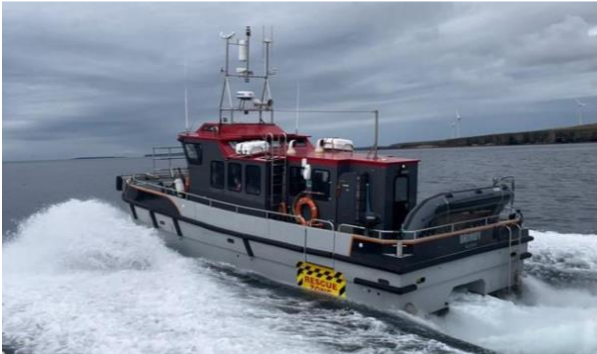
Figure 2: Northerly Explorer

Dice works will be conducted from the Northerly Explorer during slack tides. The vessel will be maintaining a listening watch on Channel 16.