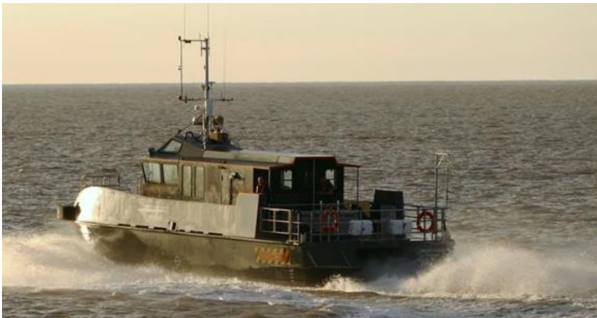
Figure 3: Athenia

The survey vessel Athenia will be conducting subsea surveys across the turbine array.