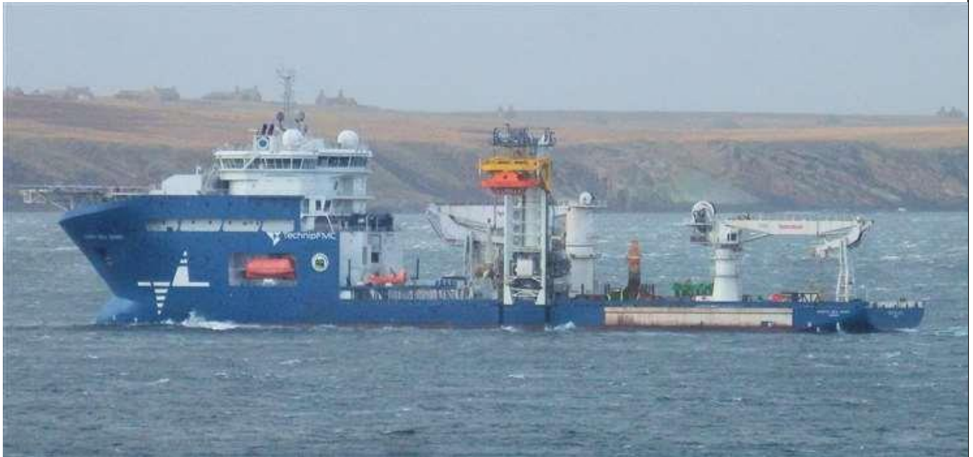
Figure 2: North Sea Giant

The DP Construction Vessel the North Sea Giant will be involved in these operations. The vessel will be maintaining a listening watch on Channel 16.