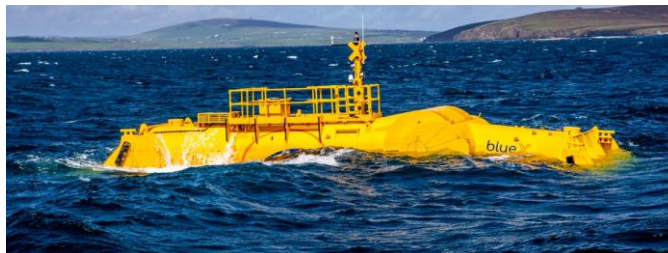
Device on Site: Blue X

Device will remain on site for the stated duration, please beware device AIS offline at the moment.