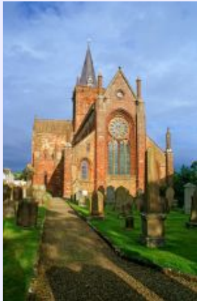
St Magnus Cathedral

Leave Orkney's largest island and follow the coast of Scapa Flow to the smaller South Isles. Driving over the Churchill Barriers, built during the Second World War to protect Scapa Flow, we visit the beautiful, hand-painted Italian Chapel, built by Italian prisoners of war who were interned on this small island during World War Two.