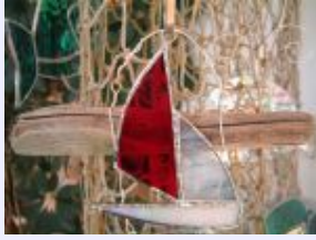
Crafts from Bill Corin

Leave Orkney's biggest island and follow the coast of Scapa Flow to the smaller South Isles. Drive over the Churchill Barriers, built during the Second World War to protect Scapa Flow and visit the beautiful, hand-painted Italian Chapel, built by Italian prisoners of war who were interned on this small island during World War Two.